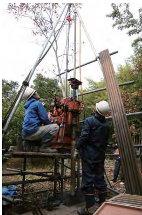
Figure 2. Core operations on a terrace in Tonohama, near type locality of Ananai Formation.