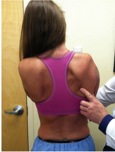
FIGURE 1: Photo taken at four months after the index TSA shows the patient's right scapular winging with clear atrophy of the trapezius muscle. The patient is pressing her hands against the wall in front of her.

shoulder motion. She worked as a nurse in an outpatient clinic and trained horses as a hobby. For nearly a decade, she was in chronic pain management for myofascial pain syndrome, cervical radiculitis, and polyarthralgia (these were her diagnoses before the diagnosis of EDS was established). Three years prior, and based on clinical criteria, she was diagnosed with EDS (with features of types II and III).