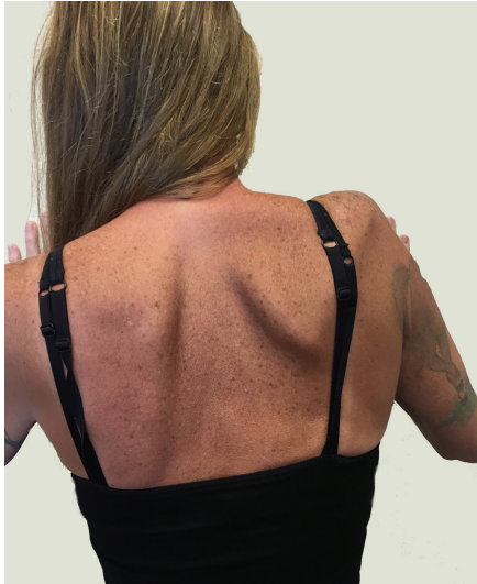
FIGURE 5: Photo taken 24 months after the index TSA shows the patient's back while she presses her hands against the wall in front of her. The trapezius atrophy has worsened and the lateral scapular winging is more pronounced than six months prior (Figure 4).

No additional surgery was planned and the patient was highly unsatisfied with her shoulder function (Figure 5).