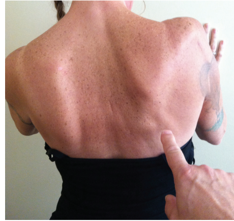
FIGURE 4: Photo taken 18 months after the index TSA shows the patient's back while she presses her hands against the wall in front of her. Although scapular winging is still obvious, there is increased mass of the trapezius when compared to the image taken 14 months prior (Figure 1). Although periscapular muscle tone had improved, shoulder function was not significantly changed.

(2) the pectoralis major muscle (not examined in the first study) showed motor unit changes consistent with previous axonal loss with reinnervation, and (3) motor units in the upper, middle, and lower portions of the trapezius muscle were present, which was considered an indication of improvement. Consultation with another physical therapist was then obtained because of the patient's continuing complaints of "intolerable pain" during physical therapy sessions, which