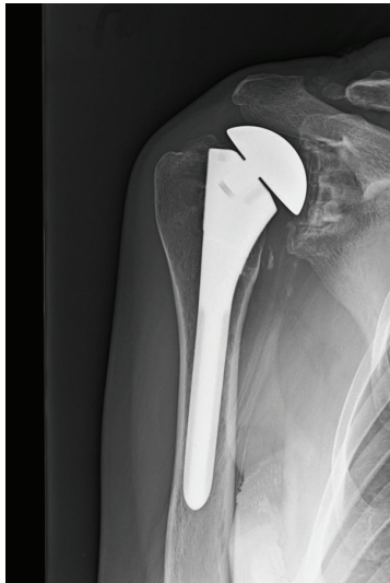
FIGURE 3: Anterior-posterior radiograph of the patient's right shoulder taken eight months after the revision of the humeral head (16 months after the index TSA). Narrowing of the distance between the acromion and the humeral head seen in this image is suggestive of weakness or a tear of the superior rotator cuff [28].

(2) the pectoralis major muscle (not examined in the first study) showed motor unit changes consistent with previous axonal loss with reinnervation, and (3) motor units in the upper, middle, and lower portions of the trapezius muscle were present, which was considered an indication of improvement. Consultation with another physical therapist was then obtained because of the patient's continuing complaints of "intolerable pain" during physical therapy sessions, which