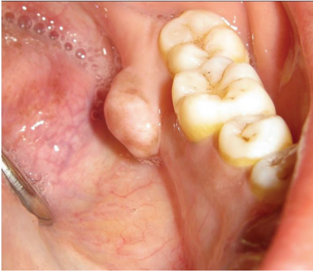
FIGURE 1: Intraoral picture of the lesion.

with only 26 cases found till now not related to Gardner's syndrome [14].