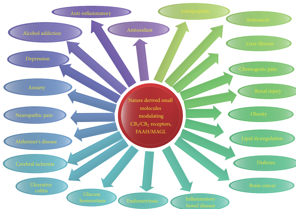
FIGURE 1: Cannabinoid receptor mediated medicinal and pharmacological activities of lead compounds isolated from medicinal plants.

been isolated and characterized which showed cannabinoid receptor affinity, efficacy, and therapeutic benefits in the in vitro , in silico , and in vivo studies [15–21]. The agents were also found to inhibit endocannabinoid metabolizing enzymes, FAAH, DAGL, and MAGL inhibitors, and exhibit their potential efficacy mediated by the cannabinoid mediated mechanism [7]. Figure 1 depicts the cannabinoid receptors and endocannabinoid metabolizing enzymes mediated pharmacological effects and therapeutic benefits of small molecules derived from nature.