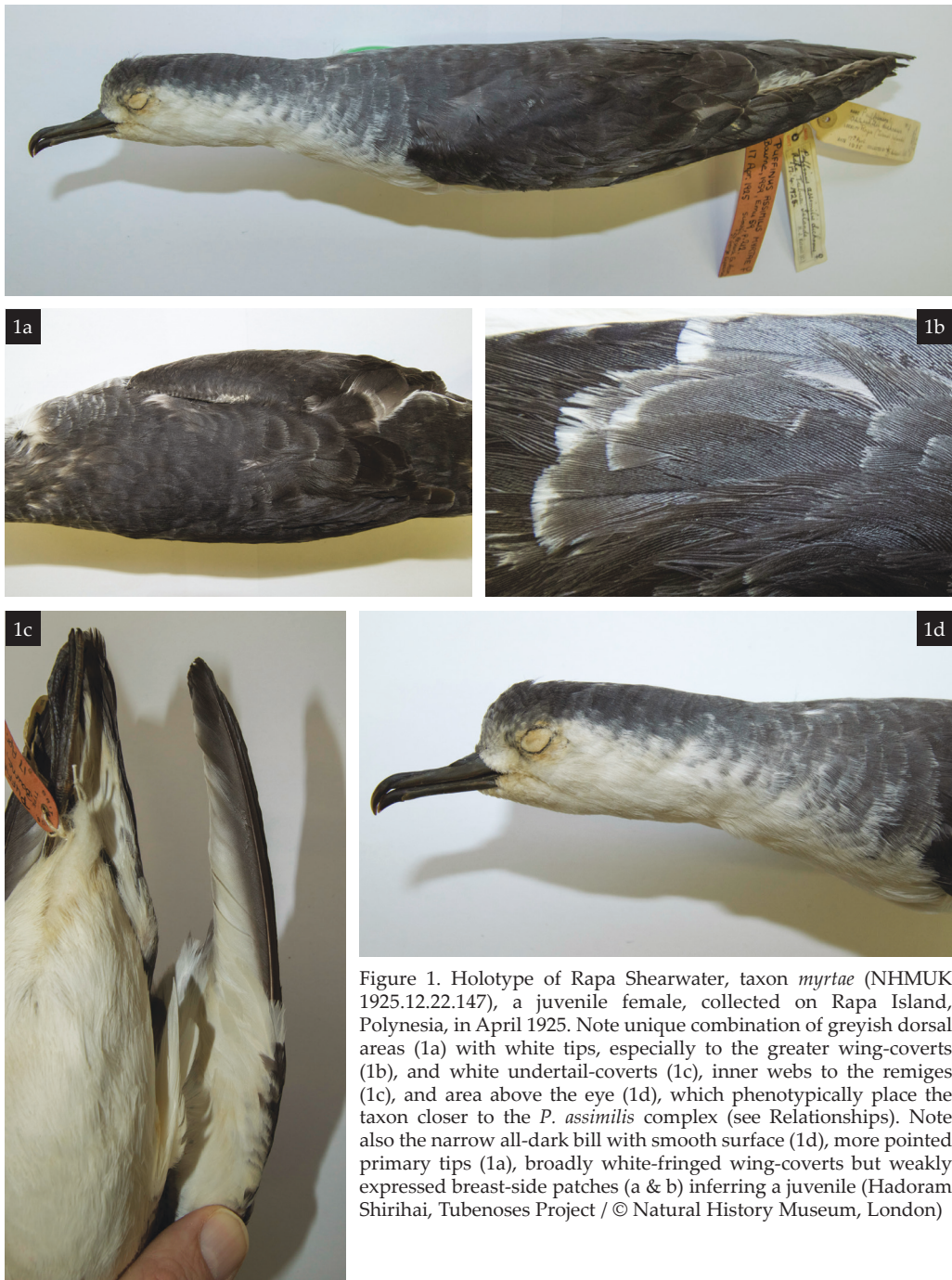
Figure 1. Holotype of Rapa Shearwater, taxon myrtae (NHMUK 1925.12.22.147), a juvenile female, collected on Rapa Island, Polynesia, in April 1925. Note unique combination of greyish dorsal areas (1a) with white tips, especially to the greater wing-coverts (1b), and white undertail-coverts (1c), inner webs to the remiges (1c), and area above the eye (1d), which phenotypically place the taxon closer to the P. assimilis complex (see Relationships). Note also the narrow all-dark bill with smooth surface (1d), more pointed primary tips (1a), broadly white-fringed wing-coverts but weakly expressed breast-side patches (a & b) inferring a juvenile

because the dark crown reaches maxilla, with diffuse greyish-white upper forehead. Within the largely uniform head to tail and entire upperwing, the crown is noticeably blacker (appearing almost capped), as are the mantle, lesser coverts and carpal area to primaries. Clear demarcation between dusky upperparts and white underparts otherwise broken only by weak breast-side patches (dull blackish-brown mottling). Throat, breast and flanks