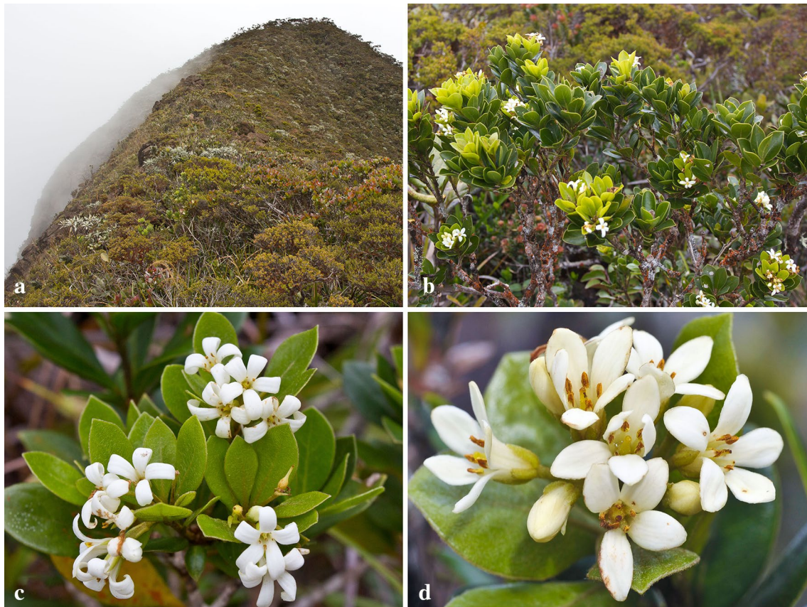
Fig. 1 Pittosporum peridoticola in the field: (a) Habit of plant growing on ultramafic bedrock; (b) Whole plant; (c) Inflorescence; (d) Detail of inflorescence. (Photos by A. van der Ent and R. van Vugt)

2574—Tambuyukon ridge second peak; SNP 30597. Specimens were all flowering and collected by Van der Ent et al.