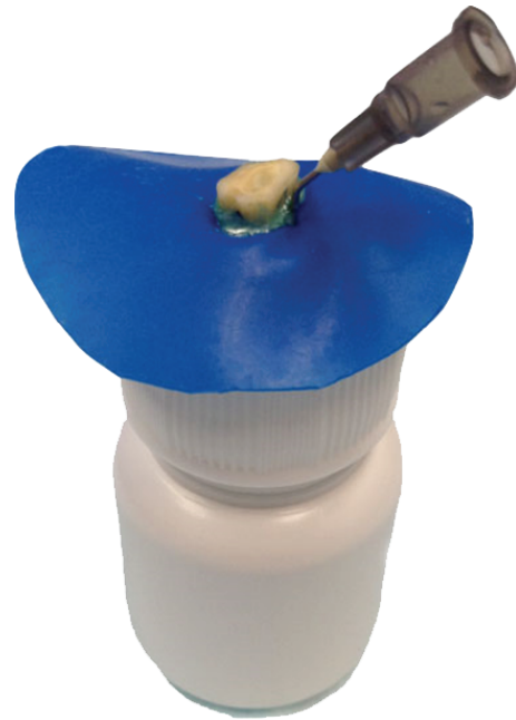
FIGURE 1: Modified apparatus used to evaluate the apical extrusion of debris.

2.2. Initial Weighing of the Eppendorf Tubes. The experimental model described by Myers and Montgomery (1991) [10] was used to evaluate the debris extrusion (Figure 1). An Eppendorf tube (Eppendorf AG, Hamburg, Germany) was numbered for each sample, and a hole was made in its lid. The Eppendorf tubes were individually weighed on an analytical balance with an accuracy of 0.0001g (Denver Instrument GmbH XP series, Göttingen, Germany), and each tube was weighed five times. The heaviest and lightest weights were discarded, and the arithmetic mean of the remaining three weights was regarded as the starting weight of the Eppendorf tube. To prevent the accidental leakage of the irrigating solution during the experiment, the apparatus was covered with a rubber sheet after fixing the root in the tube lid with cyanoacrylate. The Eppendorf tube was placed in an opaque bottle to prevent the operator from being able to see the root canal during instrumentation. A 27G needle was folded and inserted in the Eppendorf lid to equalize the internal and external pressures.