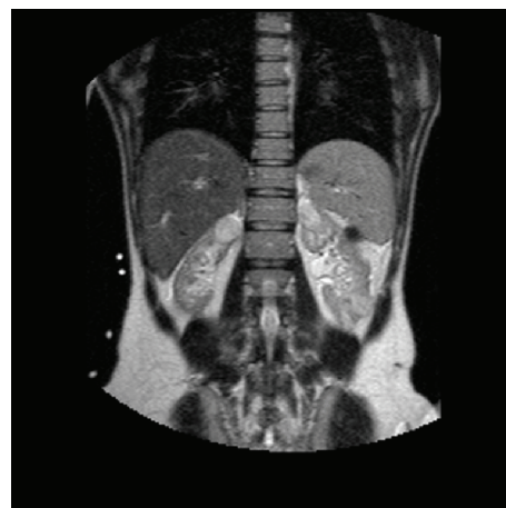
FIGURE 1: T2-W coronal MR image demonstrates a large right renal mass and numerous left renal masses, some of which were not evident on the US.

There is an increased incidence of TB in ESRD compared to the general population. This is especially important in areas