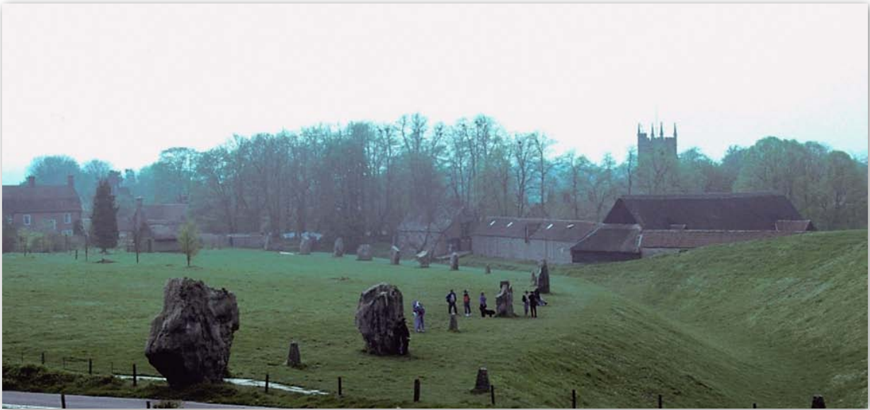
Ancient stones at Avebury.