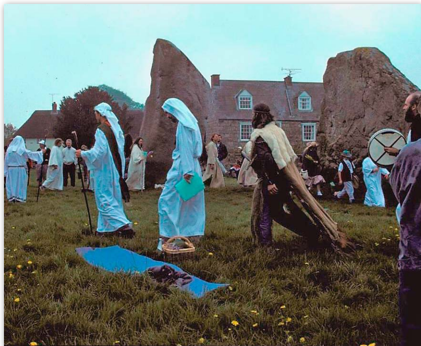
Druid ceremony at Avebury.