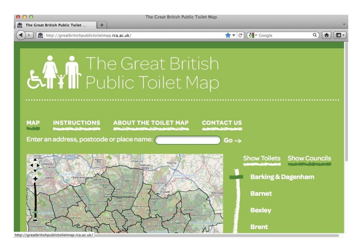
Figure 5: The Great British Public Toilet Map

The GBPTM will show which councils publish Open Data about their toilets. Toilet data already released is shown on the map so that people can find the facilities. If a council has not yet published the Open Data about provision, users will be able to contact the council with a sample letter to explain why this information is useful, and encourage the council to contribute Open data to The Great British Public Toilet Map.