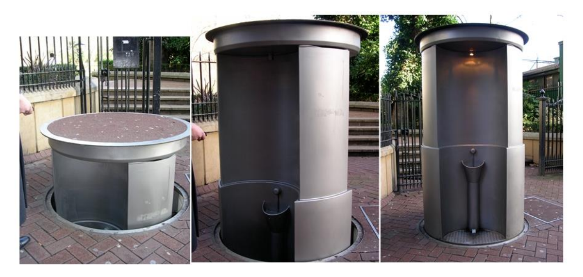
Figure 4: Urilift Urinal

These innovations in public toileting provision have not achieved preference amongst users, and have therefore not met people's needs, especially those of the ageing population. Therefore, the researchers at the Royal College of Art Helen Hamlyn Centre for Design have investigated how provision can best be maximised to offer toileting facilities that are well designed for hygiene, access, comfort and dignity, that will be welcomed by members of the public and that will also be secure, to meet the needs of the providers.