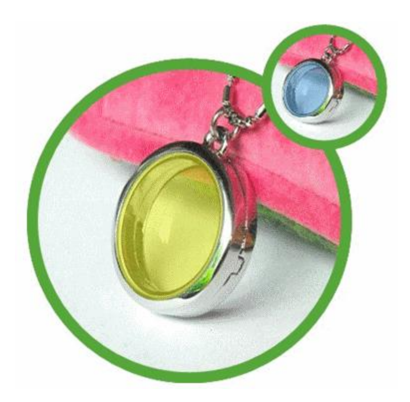
Figure 2: Colour Change Odour Detector

The odour detector uses a dye that changes colour from yellow to blue in the presence of sub-olfactory levels of ammonia. Ammonia is produced by the breakdown of urea, which is always present in urine. Although urine odour is a complex mixture of volatiles, ammonia is used as a reference component for detection. The colour change element in the dye turns blue when the product detects the presence of very low levels of ammonia. The dye film is encapsulated in a discreet product, for example a key ring or bracelet so that the user can hold it in their lap whenever they are concerned about odour. Most people who use continence pads do not smell of stale urine, but they are afraid that they might. The primary purpose of the odour detector device therefore is reassurance. Lockets could be made with a colour change element, that could be incorporated in either bracelets or key ring fobs. The colour changing jewellery could be fabricated at an affordable cost.