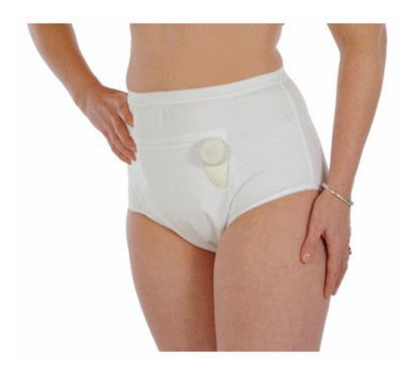
Figure 1: Smart Underwear with Signalling Unit

The Smart Underwear is a conventional looking garment with twin tracks of conductive yarn sewn into an insert in the underwear. The course of these pathways follows the anticipated edge of a disposable continence pad in use. The conductive yarn pathways terminate with a press-stud at one end of each track, to which the signalling unit is attached. These 'sensors' activate the signalling unit in the presence of urine. When thus activated, a microcontroller begins a sequence to energize the vibration unit. This vibration alerts the wearer of the underwear to the overflow of urine. The means of alerting, style of underwear, position of the signalling unit and colour of the underwear were selected by the focus groups.