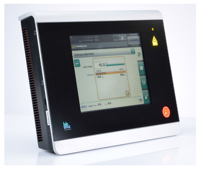
Fig. 1 Leonardo DUAL 45<sup>©</sup> diode laser from Biolitec AG, Germany. Wavelength 980–1470 nm. Maximum energy 15 Watts

The laser probe was inserted through the perineal fistula opening using either a "Ceralas©" (or more recently, a "Leonardo DUAL 45©") diode laser (Biolitec AG, Germany). This type of laser delivers energy at a wavelength of 1470 nm (Fig. 1) providing an optimal absorption curve in water which is considered to result in a more efficient local tissue shrinkage and protein denaturation. When there is no longer any water in the tissue and the temperature exceeds 100 °C, a white smoke vaporization effect is observed. The use of this wavelength by the radial-tip laser fibre permits destruction of the granulation and epithelial tissue causing a 2- to 3-mm zone of controlled tissue damage with less power (13 W) and a diminished likelihood of perifistular collateral