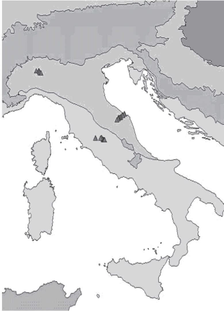
Figure 1. Map showing the three riparian populations of P. alba studied in northern Italy (Ticino) and central Italy (Cesano to the east and Paglia-Tevere to the west). The background shows the main biogeographical regions of Italy according to the EEA biogeographical map of Europe (2001), including the biogeographical subdivision due to the Apennine mountain range.

analysis of fine-scale SGS, because it yields a broad distribution of inter-individual geographic distances (Vekemans & Hardy 2004). The position of each single tree was recorded using a Global Positioning System (GPS) device. The age of most collected trees was estimated, on the basis of the trunk diameter, to be between 20 and 100 years.