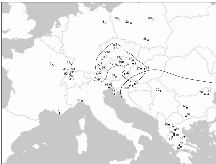
Fig. 1 Cluster analysis on the most important parasitoid species of C. ohridella (white dots = NW-cluster, black dots = SE-cluster); lines show the boarder of the two

which is known to have a narrow host range. At a first glance the parasitoid complex of C. ohridella in Europe seemed to be relatively uniform. 17 out of 29 parasitoid species were reared from this leafminer in the whole investigated area. However, the cluster analysis revealed striking differences in the distribution pattern of the parasitoid species. The complex was separated in a north-western and a south-eastern cluster (Fig. 1). The north-western cluster (=NW-cluster) comprised most of the samples collected in northern, western and central Europe. The south-eastern cluster (SE-cluster) comprised mainly those collected in south-eastern Europe. The two clusters overlapped in northern Italy and in the south and east of Austria. The mean age of the C. ohridella populations was significantly different between the two clusters (Table 2). Average host residence time in the NW-cluster was only 4.8 years while C. ohridella was present in the SE-cluster for more than 11 years. However, differences in species richness, species diversity and species evenness between the NW- and the SE-cluster were not significant.