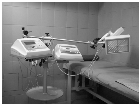
Figure 2 Aparat Viofor JPS Standard to magnetoledtherapy procedures.

The magnetic field intensity amounted to 6. The procedures were performed in outpatient mode, two times a day, daily, for 3 weeks. After each procedure, the wound was dressed in a protective dressing.