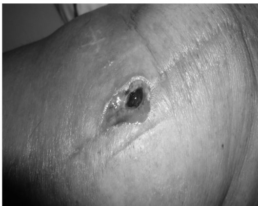
Figure 3 Photograph taken 15 days after beginning therapy.