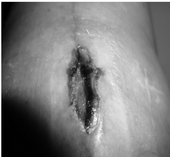
Figure 1 Photograph taken before starting the therapy.

On admission, the patient was found to have a wound in a persistent inflammatory condition and with pus secretion (Figure 1). Also on admission, in addition to the