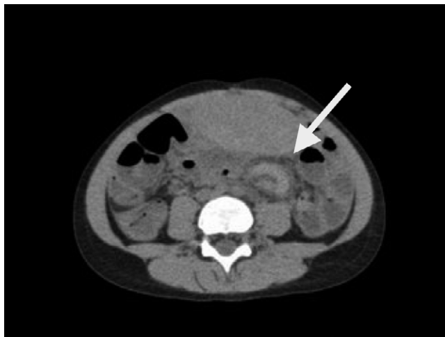
Figure 1. Computed tomography scan showing the spleen in the pelvis. The whirl sign (arrow) indicates torsion of the vascular pedicle.