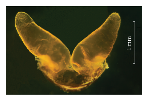
FIGURE 1: Defensive gland of Mesomorphus villiger cut from the remainder of the sternites.