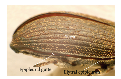
FIGURE 3: Epipleural gutter on the elytra of Mesomorphus villiger.

Reservoirs consist of the intersegmental membrane evaginations between the seventh and eighth sternites, occur on either side of hind gut, and are immersed in a thick matrix