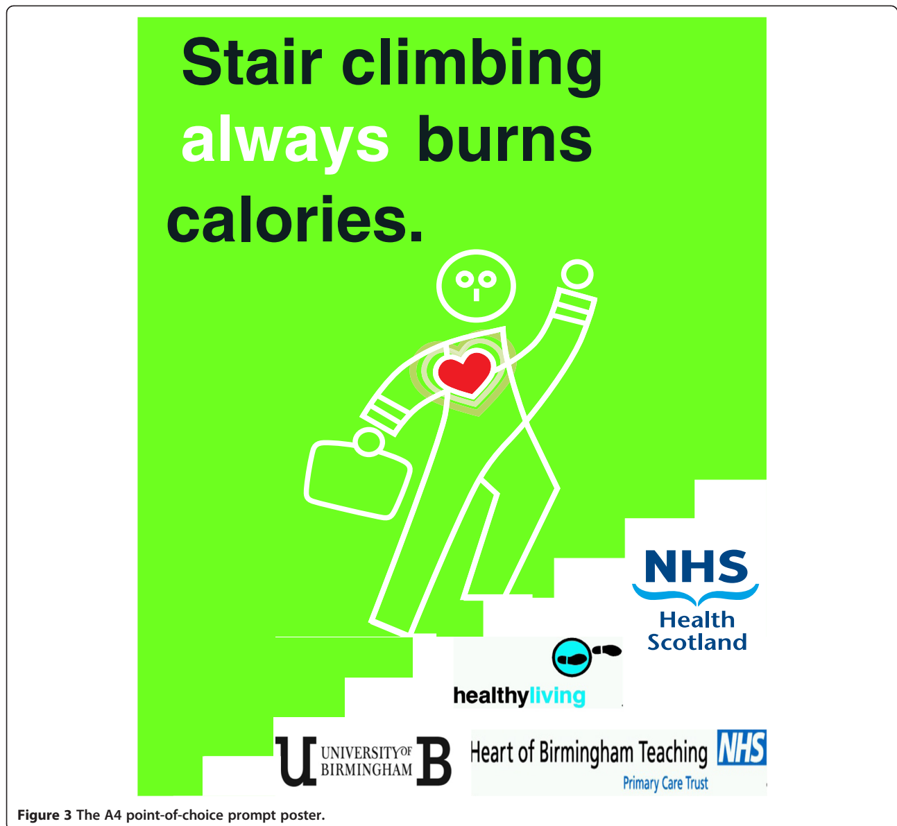
Figure 3 The A4 point-of-choice prompt poster.

Posters + Stairwell messages site relative to the Poster alone one and no differences between the two sites for messages not positioned at either site.