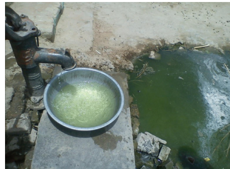
FIGURE 1: Photograph of yellow-colored contaminated water from a handpump.

We understand that by affecting the individual's ability, genetic polymorphisms of NQO1 , hOGG1 , GSTM1 , and GSTT1 may influence occurrence of dermatological outcomes among general population exposed to Cr(VI). We conducted the present study which involved residents from Cr(VI) contaminated areas of Kanpur (Uttar Pradesh, India) [5]. An earlier health impact assessment-based study conducted by us revealed significantly higher prevalence of self-reports for dermal adversities among the residents from the contaminated areas as compared to residents with similar