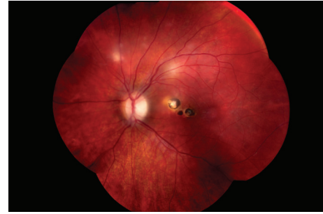
FIGURE 2: New lesions in the left eye of a child with known congenital toxoplasmosis. The central scars were long-standing. The peripheral lesions occurred in regions previously felt to be normal. Multifocal reactivation is unusual.

The greatest amount of information about vertically transmitted infectious uveitis relates to congenital toxoplasma chorioretinitis. Screening of pregnant women is sometimes undertaken proactively in countries with high frequencies of congenital toxoplasmosis, such as France [38]. This research enabled the establishment of antibiotic regimens for primary prevention of toxoplasma infection in the fetus, if seroconversion occurs during pregnancy. Diagnosis by ocular screening of mothers is not efficient because only