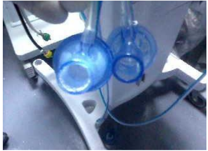
Figure 2. Flow sensors; white crystals noted in the internal part for a patient who received nebulized colistin (left), while the other flow sensor for a patient who did not receive nebulized colistin (right)

change at a median of 7 days (range, 2-25) after initiating NC; this was followed by changing the flow sensor and nebulizer kit in 82% and 41% of the cases, respectively.