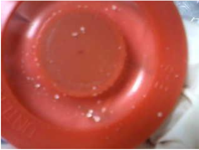
Figure 1. Exhalation membrane; white crystals noted in the center.