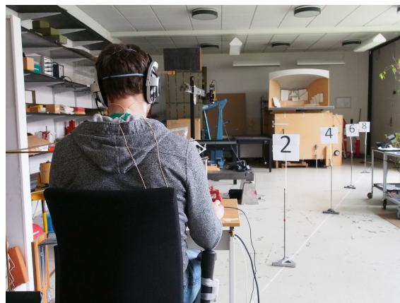
Figure 1: Photograph of the listening test setup in the workshop room with visual markers at 2, 4, 6, and 8 m.

For each experimental run, a random sentence from the Danish HINT speech test corpus [5] was convolved with the measured BRIRs and the inverse of the HPIRs. The resulting auralized signals were band-limited between 50 and 15000 Hz with 6th order Butterworth filters (Broadband condition). Apart from the broadband condition, two conditions were tested with lowpass-filtered stimuli, either with a cutoff-frequency of 6 kHz to simulate the limited bandwidth of a hearing aid or with a cutoff-frequency of 2 kHz to simulate a hearing loss. Both lowpass-filters were realized as 32 tap Hamming-window based FIR filters. The listeners were instructed to judge