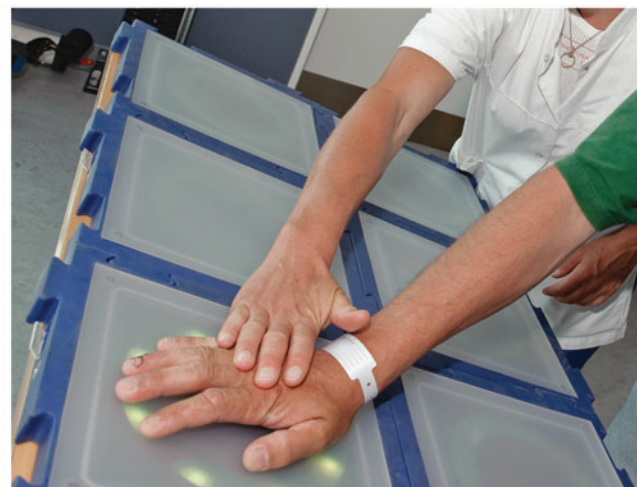
FIG. 1. The modular interactive tiles can be assembled in different configurations ( top left, top right, and bottom right ) for different playful exercises and levels.

modular interactive tiles once a week for 12 weeks. The senior community activity centers are organized so that most elderly individuals are transported to the centers from their private homes once or twice a week to engage in center activities for social interaction, and the elderly participants