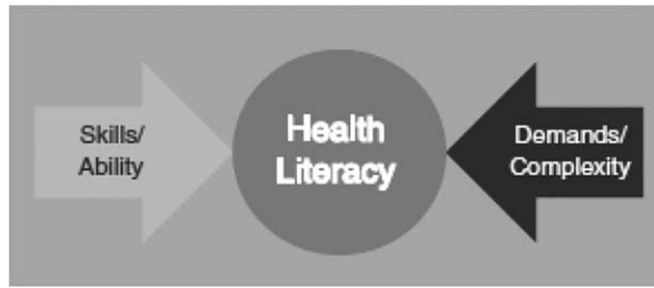
Fig. 1. Reproduced from: Parker R. Measuring health literacy: What? So what? Now what? In: Hernandez L., editor. Measures of health literacy: workshop summary, Roundtable on Health Literacy. Washington, DC: National Academies Press; 2009, p. 91–98 [46].