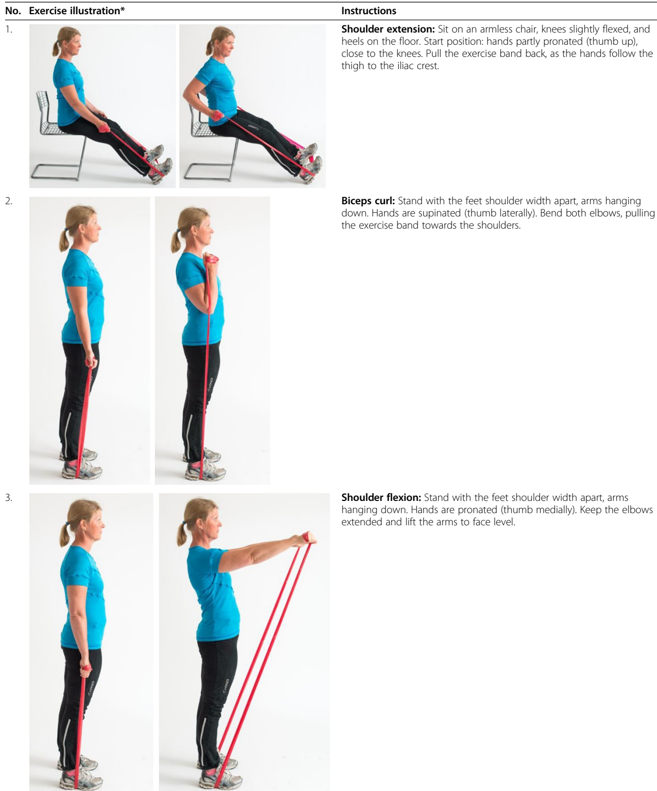
Table 2 Exercise programme for people with hand osteoarthritis