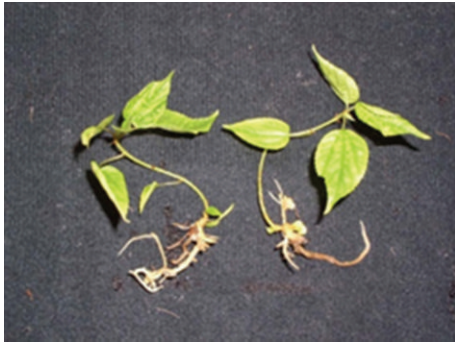
FIGURE 3: In vitro plantlets 2 months after acclimatization in soil. Bars = 30 mm.

conservation and large-scale vegetative propagation of H. dulcis .