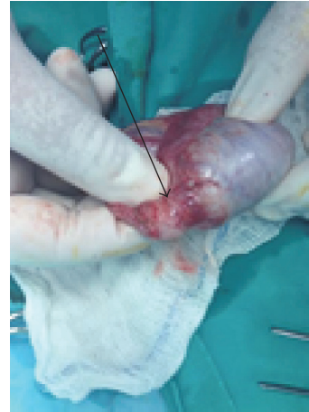
FIGURE 2: Yellowish uncapsulated mass (arrow) with maximum diameter of 13 mm located next to the tail of the epididymis.

Adenomatoid tumors are the most common tumors of middle-aged patients; average age of clinical presentation is