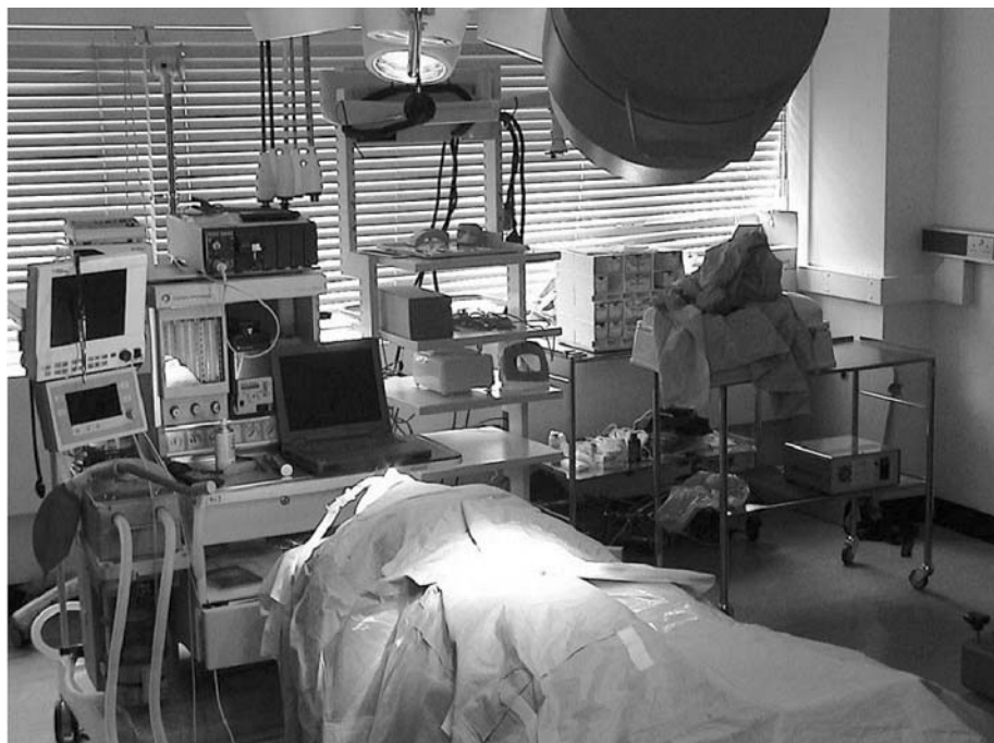
Figure 1 The simulated operating theatre.

In a preliminary study, 25 surgeons of varying grades completed part of a standard varicose vein operation on a synthetic model (Limbs & Things, Bristol, UK) which was placed over the right groin of the anaesthetic simulator. 26 The complete surgical team was present, the mannequin draped as for a real procedure, and standard surgical instruments available to the operating surgeon. Video based, blinded assessment of technical skills discriminated between surgeons according to experience, though their team skills measured by two expert observers on a global rating scale