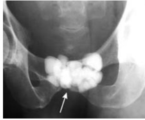
FIGURE 1. Plain film centred on the pelvis showing multiple stones in the prostatic area (arrow).

intraprostatic stones with normal seminal vesicles. Chest X-ray as well as abdominal ultrasonography were normal. Urethroscopy showed an intraprostatic cavity containing multiple stones that communicated with the prostatic urethra through multiple orifices of different sizes (Video 1). The stones were pushed back into the bladder before being fragmented with a ballistic lithotripter and evacuated. The patient had transurethral resection of the prostate, allowing wide communication of the bladder with the intraprostatic cystic cavity. Pathological examination of the prostatic specimen showed the cystic cavity to be an intraprostatic hydatid cyst (Fig. 2) evacuated into the prostatic urethra and complicated by stone formation. Postoperative course was uneventful and the patient became asymptomatic.