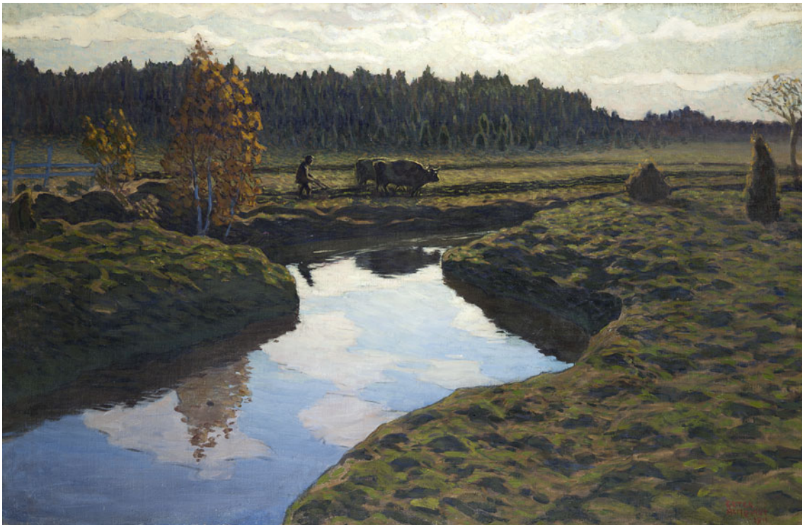
Fig. 1 Cultivation of a drained mire. ‘Autumn Ploughing in the Marshland’, painting by Ester Almqvist 1911. Gothenburg Museum of Art

The practice of setting aside part of the arable land for small-scale cultivation of vegetables and peas started during this period or possibly a few centuries earlier. However, according to official statistics, only 1 % of all arable land was used for growing peas/beans, and Morell (1998) states that a fair fraction of this land would have represented contract cultivation in Southern Sweden (i.e., not for local consumption). Moreover, peas and beans do not grow well on soils rich in organic matter.