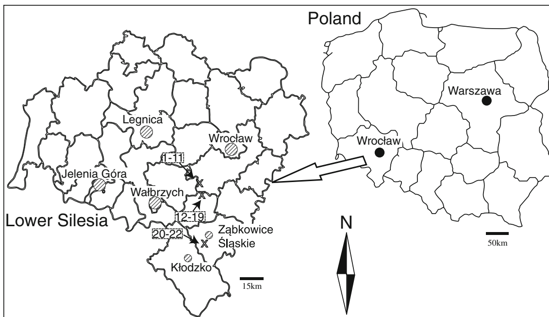
Fig. 1 Map showing study areas and sampling locations (x)

rhizomes and second with “serpentinite” rhizomes. Each of them was divided into three subgroups which received Cr, Ni, and mixture of Cr and Ni, respectively. Metal salts were applied as 0 (control), 50, 100, and 250 mg kg -1 of dry weight