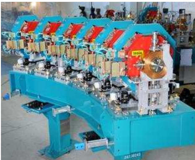
Figure 2: An EMMA girder, with 6 doublet cells mounted. The larger of the magnets is the D and the smaller is the F. RF cavities are mounted in almost every other cell and one can be seen at the end of the girder.

However, to maintain the symmetry of the ring and minimise the effects from resonances, clamp plates are mounted on all the doublets.