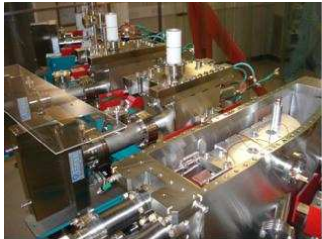
Figure 3: The injection septum and kicker magnets mounted on the injection girder. Note that the top half of each ring magnet has been removed, as has the top flange of the septum box.

the beam. The resulting injection septum and the 2 injection kickers are shown in figure 3. Note that these achieve all the requirements other than the leakage field of the septum and oscillations in the kicker fields after the 55ns fall time. It is believe that these problems can be dealt with in other ways.