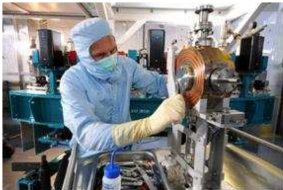
Figure 4: An EMMA RF cavity under test.

The ultimate performance on the accelerator will be the ability of the cavities to efficiently transfer energy to the beam. For EMMA, a normal conducting single cell re-entrant RF cavity design has been optimised for high shunt impedance, working within geometrical constraints of 40 mm beam aperture and 110mm flange to flange length availability. The custom in-house design shown in figure 4 meets the operation specification.