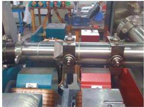
Figure 5: An external view of two 4-button BPMs. The top halves of the neighbouring ring magnets have been removed.

before EMMA, in the ring and destructive devices are mounted in an external diagnostics beam line. The injection line is instrumented with 4 beam position monitors (BPM), 6 motorised YAG screens, including 3 in a tomography section for measuring the beam emittance, a wall current monitor and a Faraday cup, onto which the beam can be directed. In the ring, there will be 2 BPMs per cell (see figure 5), except around the injection and extraction regions, where there is insufficient space for 1 device in each region. There will be 4 motorised YAG screens that can be moved into and out of the ring. These will be driven in from the outside of the ring and will have no support on the inner face. This will make it possible to move the screen so that it sees higher energy orbits, while the lower energy orbits will be undisturbed. There will also be a wall current monitor in the ring.