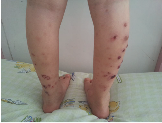
FIGURE 1: Palpable purpura and hemorrhagic bullae on both lower extremities.

pain. There was no history of reduced urine output, visible blood in the urine, or black stool. The case had taken no medication and had no history of upper respiratory tract infections or animal/insect bites for at least 1 month prior to the onset of rashes.