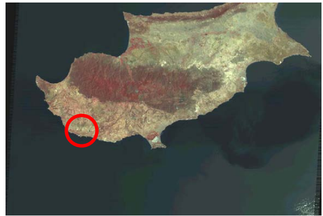
Fig. 1. Landsat-7 ETM image of Cyprus. The study area is marked.

For estimating ET_c , multispectral (visible and infrared bands) Landsat-7 ETM+ satellite images have been used, along with meteorological data. Air temperature, atmospheric pressure, wind speed and other data were collected from an automatic meteorological station (placed at 1.2 m height above ground surface), located at Paphos International Airport, in the vicinity of our study area. These data were interpolated to 2.0 m height as required by FAO Penman-Monteith method. Indeed, these interpolated values were in good agreement with those values found from a customized mobile meteorological station that we employed for calibrating and validating reasons. ERDAS IMAGINE (v.9.3 professional) has been used in the pre-processing and post-processing of the available multi-series imagery. The GER 1500 field spectro-radiometer has been used to assist the application of the atmospheric correction of the satellite images.