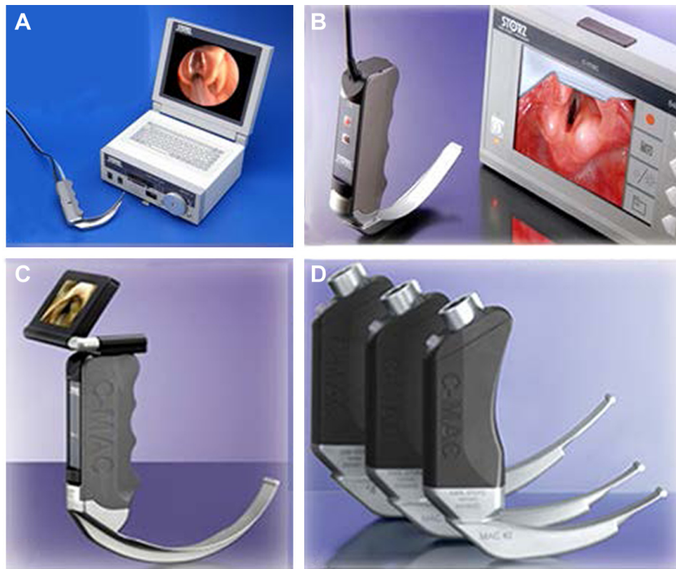
Figure 2 The C-MAC videolaryngoscope system.

Notes: (A) Storz Berci-Kaplan DCI ® videolaryngoscope (V-MAC videolaryngoscope); (B) Storz C-MAC videolaryngoscope; (C) portable C-MAC videolaryngoscope with a 2-inch pocket monitor attached to the handle; (D) the latest C-MAC handle with a lightweight and a multifunction interface. 80