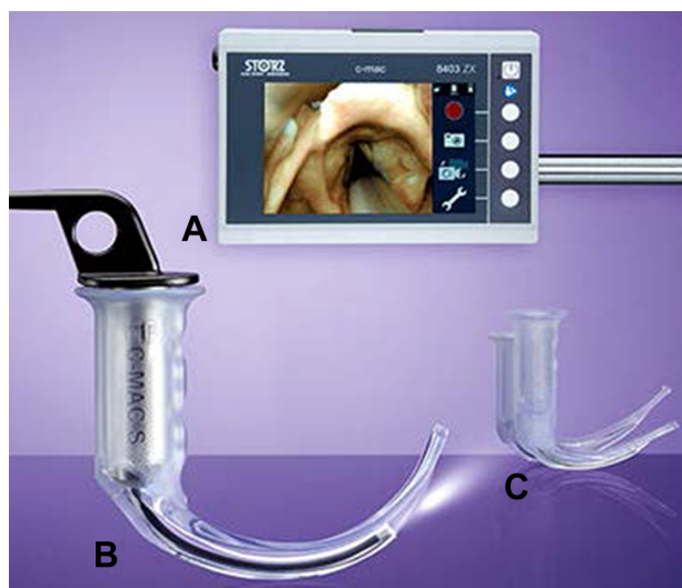
Figure 3 C-MAC videolaryngoscope with disposable plastic blade.

with 2 adult blades (sizes 3 and 4) available (Figure 2D). 80 The disposable C-MAC device contains a disposable Macintosh plastic blade, an image tube with a camera and a monitor. The image tube is inserted into the disposable plastic blade to be protected from oral contamination. However, the disposable plastic blade is not completely the same as the reusable metal blade. Both the web and flange sections of the disposable plastic blades are significantly thickened to avoid breakage during use. These additional bulk can reduce the pharyngeal view and limit space for manipulating the tracheal tube when using the disposable plastic blade. 12