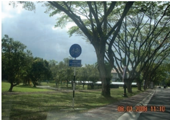
Fig. 11: Providing shady side walk and cycling lanes is a good example for UPM