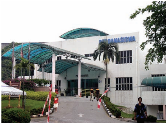
Fig. 4(a): UM uses bright and reflective colours for/in buildings to conserve the cooling energy