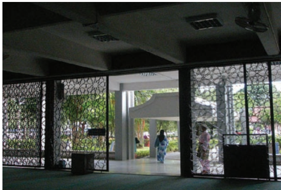
Fig. 5: Using passive ventilation for cooling buildings