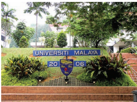
Fig. 3: UM has various types of landscape