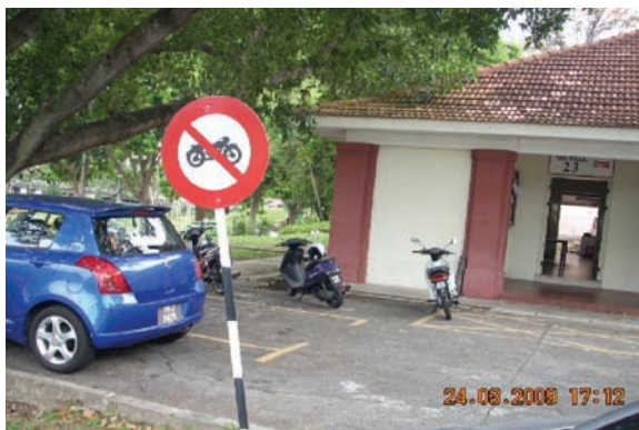
Fig. 7: Banning motorcycling without effective enforcement