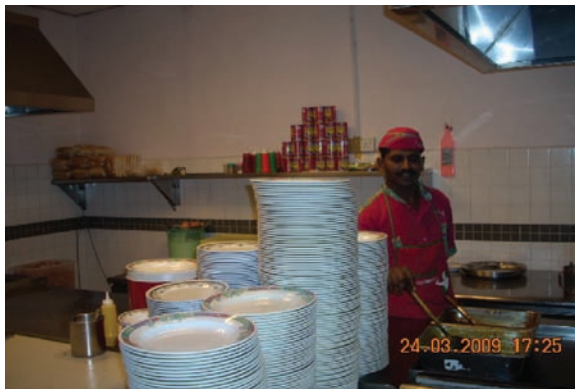
Fig. 9(a): Banning the use of poly-styrofoam in USM and using washable plate