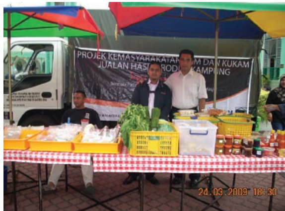
Fig. 10: Organic food sold at the entrance of USM