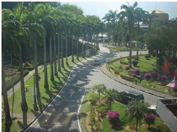
Fig. 6: Green landscaping at UKM