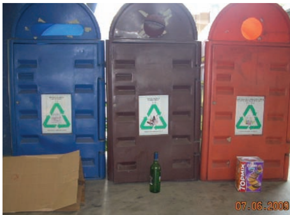
Fig. 12: Recycling bins at all faculties are parts of the facilities provided on campus

tailor shops, binding and photography services, mosque, clinic, and even petrol stations, as well as shopping malls, have been catered for inside the campus or places which can be reached in less than five minutes by cycling. Even the hostels and different faculties have housed the essential needs of their users independently and it is common to see courts for various sports such as tennis, volleyball, and basketball, football fields, as well as laundry and grocery shops, cafés and restaurants, parks, and study areas provided at these hostels.