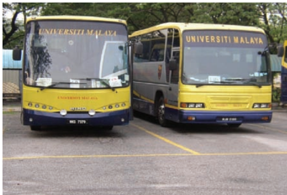
Fig. 2: UM provides comfortable buses, but majority of the students still use private transportation

some faculties, as well as constructing buildings which use passive ventilation for their cooling (see Fig. 4). In addition, UKM has unique and beautiful flora and fauna, with various indigenous sustainable landscapes, as shown in Fig. 5. The results gathered from the interviews with the students and lecturers indicated that private transportation is the most common mode of transportation, which is a big challenge for this university. For this, both the students and lecturers explained that they preferred using own transport to go home due to the inefficiency of the public transport available.