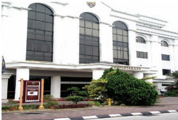
Fig. 4(b): UM uses natural lighting in its building