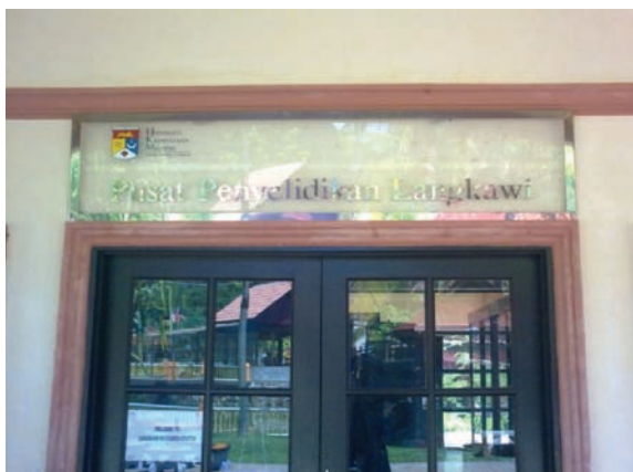
Fig. 1: UKM working on sustainability issues in Langkawi

to issues on sustainability, under the “ Kampus Sejahtera ” programme (ibid). Eight percent of 5861 research projects, conducted by USM between 1974- 2007, incorporated issues related to sustainability (ibid). Meanwhile, 11% of 1,800 papers have been published in the Institute for Scientific Information (ISI). Some 19% of the conference papers (out of 2,200) are related to sustainability. USM has offered several types of scholarship such as USM fellowship which gives RM1,500 for first year Master students, RM1,800 for second year Master students, RM2,100 for first year PhD students, RM2,300 for second year PhD students, and RM2,500 for third year PhD students (USM, 2009).