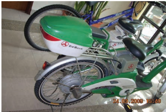
Fig. 8: USM researches on different modes of transportation