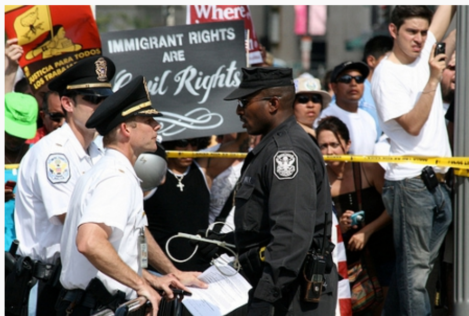
Immigration rally in Washington DC, 2010

Local police have reacted to these changes in various ways . Some have developed on-going relationships with federal immigration agents, while a small percentage have signed formal agreements to engage in immigration enforcement under the federal “287g program.” Other local governments and police departments have moved in the opposite direction. A relative handful have adopted “limited cooperation” ordinances, designating themselves as sanctuary cities, while others follow a “don’t ask, don’t tell” policy when interacting with undocumented immigrants.