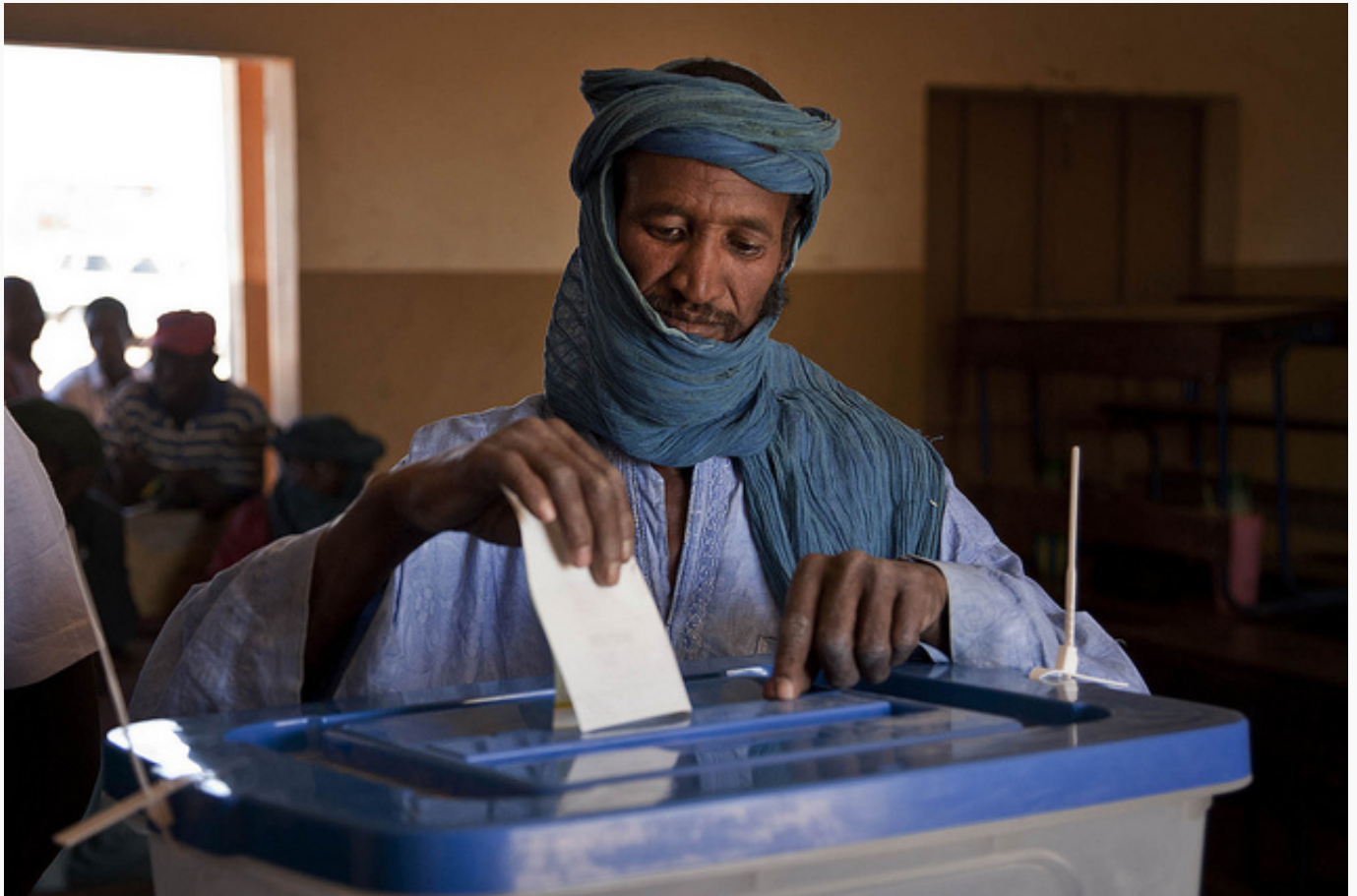
A man casts his vote in Mali, November 2013.

transformation is preventing the erosion of basic human rights and civil liberties. This includes governments having the capacity to hold free and fair elections.