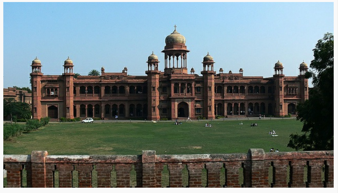
St. John's College Agra, India.

chapter in this section starts with a discussion around the First World War and ends with a discussion of the Second World War when many Indian nationalists collaborated with the Nazi Germany, motivated in part by the "politics of opportunism" and the momentum from decades of anticolonial movements (p.108).