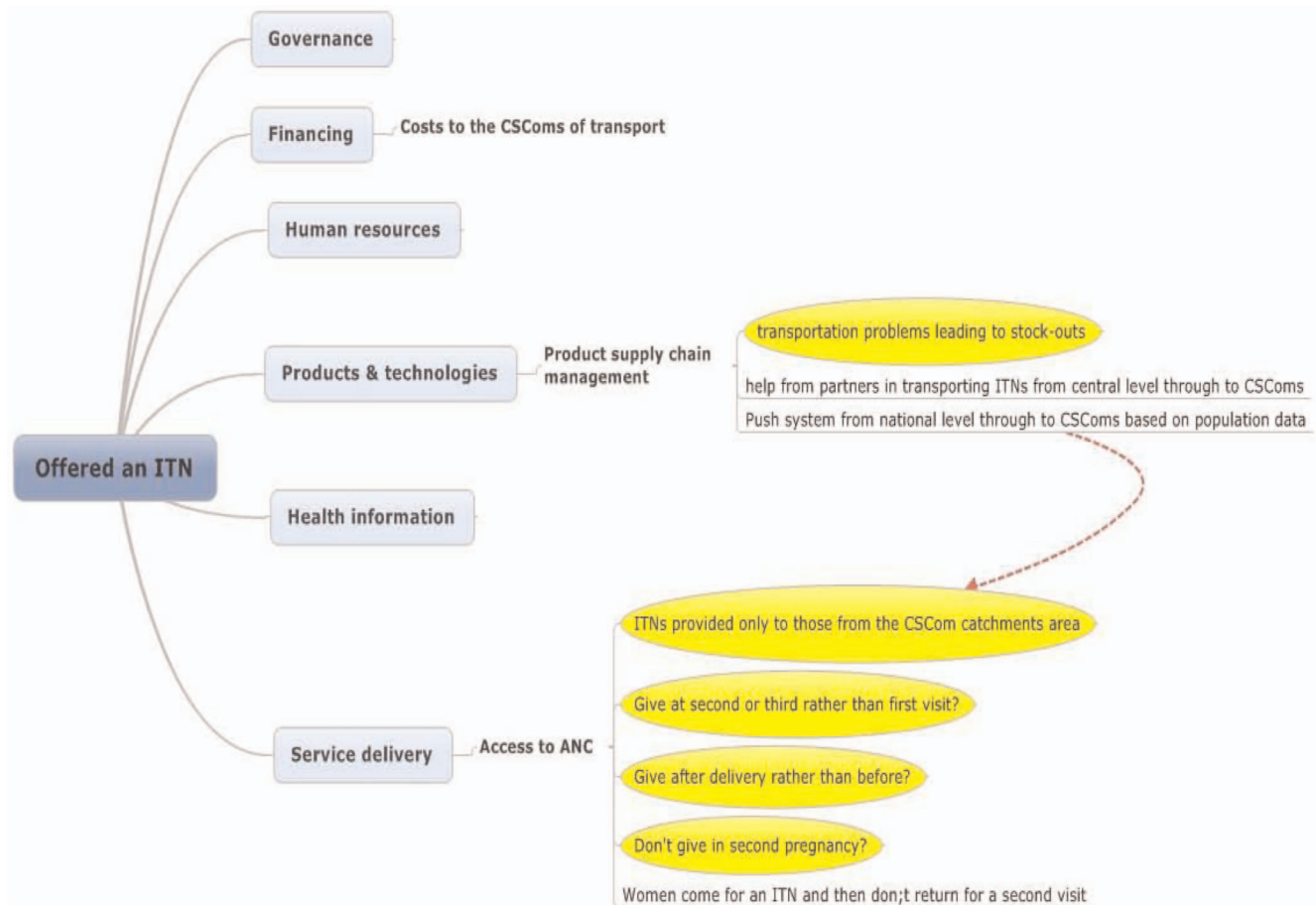
Figure 3. Factors reducing the effectiveness of pregnant women being offered an ITN during their first ANC visit. Note: ITN, insecticide treated net; ANC, antenatal clinic visit; CSCCom, centre de santé communautaire, corresponding to community health centre. doi:10.1371/journal.pone.0065437.g003

health workers reported that they would deny IPTp-SP to a pregnant woman of less than one month gestation, rather than 1 st trimester as per the guidelines.