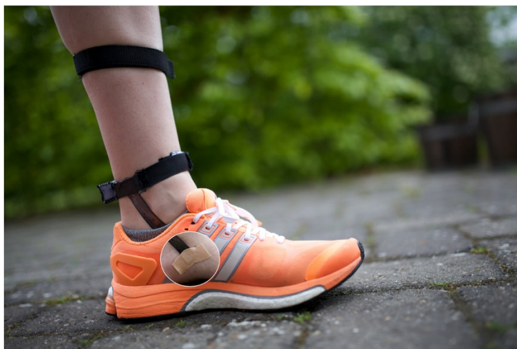
Figure 1 Placement of the stretch sensor.

malleoli to minimise the movement of the device caused by contractions of the muscles in the lower leg.