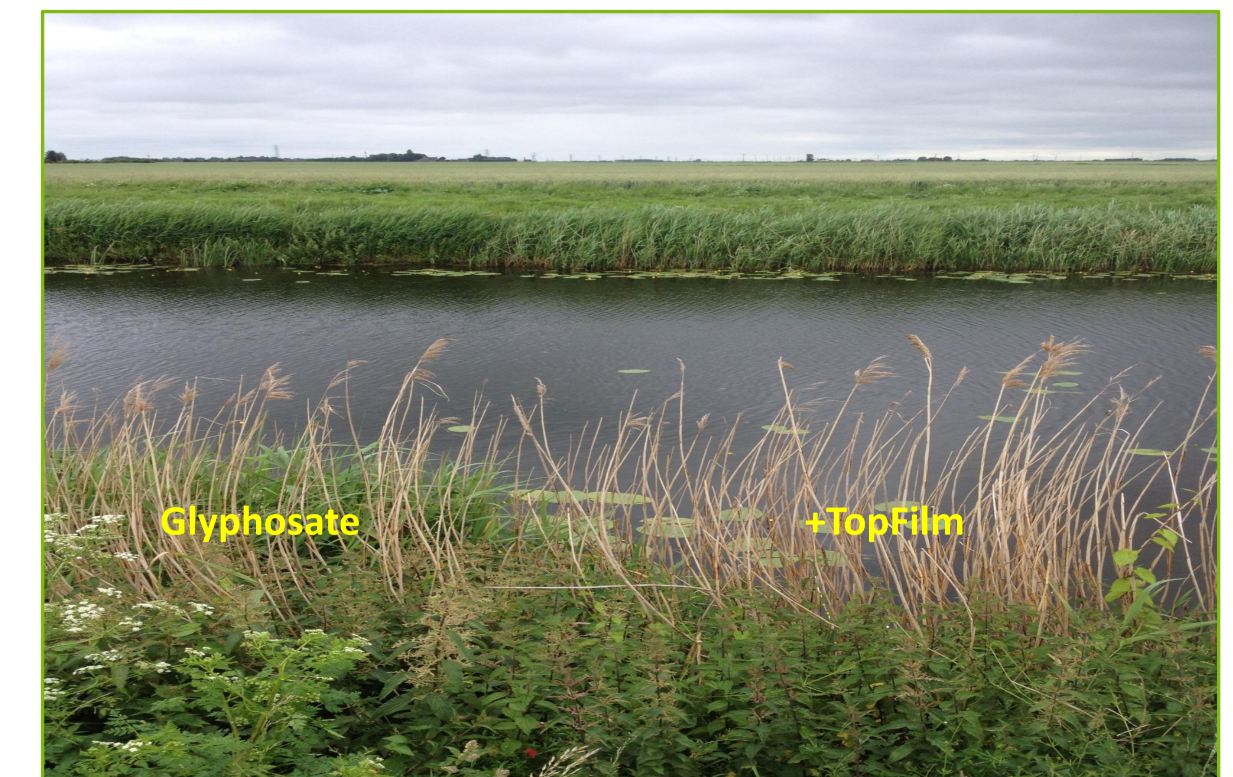
The picture shows regrowth of P. communis treated with glyphosate at quarter rate (1.25 L product per hectare) on the left and at the same rate with TopFilm on the right. The addition of TopFilm results in almost complete control at quarter rate application of glyphosate, while regrowth is unaffected at this rate without TopFilm.