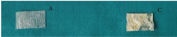
FIGURE 1: Lyophilized gamma irradiated amnion (A) and chorion (C) membranes, prepared to be used in periodontal therapy.

maintenance of biologic properties of membranes which is still the best way [9]. The amniotic membrane has gained importance specifically because of various factors. Firstly, it reduces scarring and inflammation and enhances wound healing. Secondly, it serves as a scaffold for proliferation and differentiation of cells owing to its antimicrobial properties. Thirdly, its extracellular matrix and its components, such as growth factors, suggest it to be an excellent biomaterial to act as a native scaffold for tissue engineering. Lastly, it can be easily procured, processed, and transported.