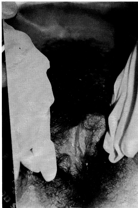
Fig. 2. The area shows complete wound cicatrization. Pregnancy was already evident.

Conventional treatment for these diseases was prescribed. The serologic tests for syphilis and HIV were positive. After 30 days the genital lesions