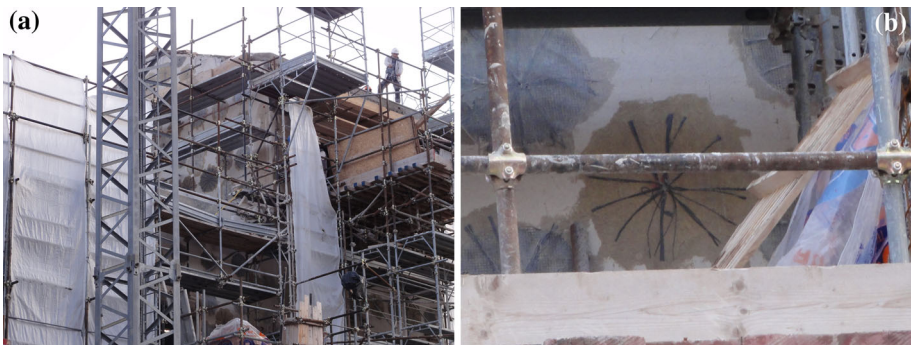
Fig. 16 Extensive use of reinforced coring with grouted injection with epoxy resins on the end wall of a five storey residential palace in the historic centre of L’Aquila

a vis [its] doubtful effectiveness, especially in the presence of walls with several wythes not well connected. In any case the durability of the strengthening element, whether of stainless steel, composite plastic materials or other material, should be ensured and the grouts used should be compatible with the original materials”. Moreover it is advised that this type of intervention only has at best a local effect (Circolare n. 26/2010).