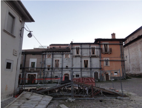
Fig. 5 Example of an aggregate: four distinct building units sharing party walls

The Filiera's mandate ended at the end of 2012. To achieve a smooth handover of the building approval process to the Municipalities, at the end of the Filiera's support period the ordinance 3803/2009 of the Prime Minister established that CINEAS and RELUIS must provide training sessions to municipal employees.