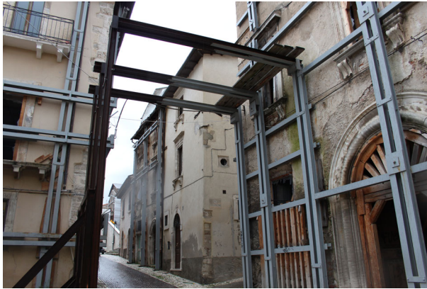
Fig. 3 Shoring system applied to buildings facing onto a narrow street

restoring the box behaviour of buildings with corner failures. In cases where the causes of failure are likely to comprise both in-plane and out-of-plane failures, a combination of the two shoring systems is required (Modena et al. 2010).