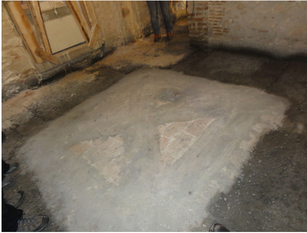
Fig. 14 reinforcement of a cross vault with strips of FRP laid at the extrados

can be obtained with such interventions (Riggio and Tomasi 2012). The joists and beams forming the floor structures should also be anchored to the walls by means of ties. A similar approach should be followed also for roof structures (Giuriani and Marini 2008). This type of intervention was traditionally extensively applied in the past and it can be observed that in cases where the ties have been well maintained and are regularly distributed on the wall, the damage is usually no greater than level B or A.