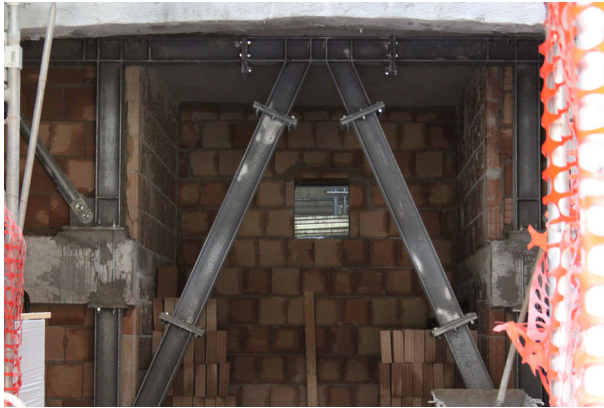
Fig. 12 Condominio Vico Picenze, L’Aquila. Retrofitted steelwork observed from the site boundary