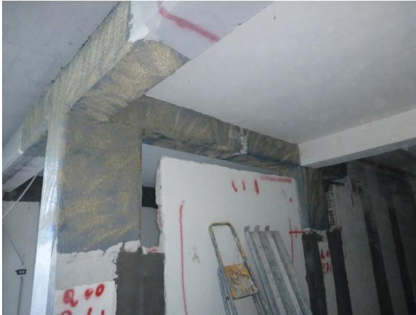
Fig. 11 Between Via Del Colle and Via di Strizzoli, Pettino. Beam/column joint strengthened with carbon fibre FRP. The image also shows that polypropylene mesh has been applied to connect the infill and columns

<100 mm, with longitudinal bars approximately 12–20 mm in diameter and transverse steel approximately 8–10 mm in diameter. Site staff informed the EEFIT team that the foundation ring and ground beams had also been improved as part of the works.