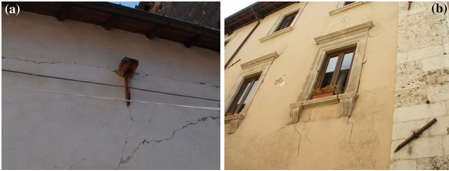
Fig. 15 Two examples of traditional reinforcement: a timber tie, b wrought iron cross tie inserted in a quoin