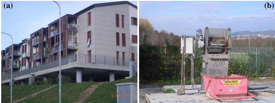
Fig. 8 Photograph of a C.A.S.E. building in the Bazzano site (a), and the inadequate sewage filtering site alongside the Aterno river (b)

was published just before the earthquake. One of the main issues discussed in the plan is the legacy of the C.A.S.E. settlements (locally termed “New Towns”) in a perspective of reshaping the suburban configuration. The Plan envisages the necessity to change from a single-centred city model to a multi-centred model; it sees the frazioni as adding new value to the city (Comune di L’Aquila 2011, p. 42). It promotes a change from the C.A.S.E. sites providing only a residential function to a multifunctional offer of spaces and services. The latter was strongly requested by the municipality in the planning phase of the C.A.S.E. sites, in fact, 30 % of the 19 New Towns’ gross surface (percentage defined by the General Regulatory Plan—Comune di L’Aquila 2011) is reserved for public facilities with social provisions (schools, health centres and parks) and facilities for locally based commercial activities (food shops, laundry services, tobacco stores, stationaries, bars, professional studies and bank offices). A fundamental aspect of the plan is to balance the depopulation of the C.A.S.E. sites—which will characterize the settlements while people will progressively return to their rebuilt or repaired houses—through the “inclusion of new social groups: young couples, students, teaching staff, researchers, artists, touristic receptivity, etc.”, supported by a more efficient delocalised network of social services (Comune di L’Aquila 2011, p. 43).