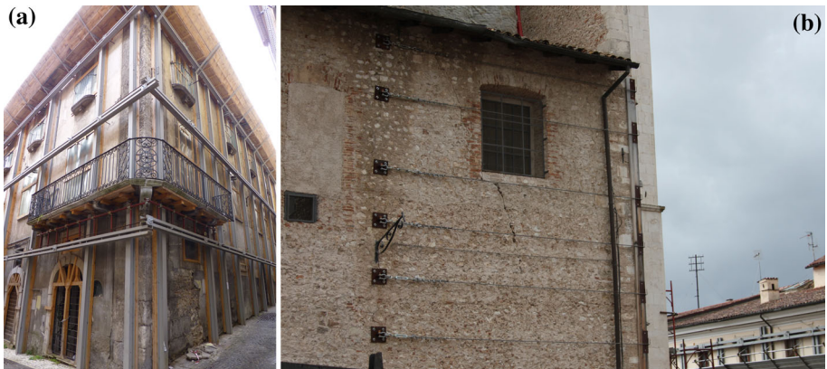
Fig. 2 Shoring system made of a steel frame to prevent combined mechanisms or overturning of the top floor and b steel cables, to prevent in plane failure and overturning of the corner