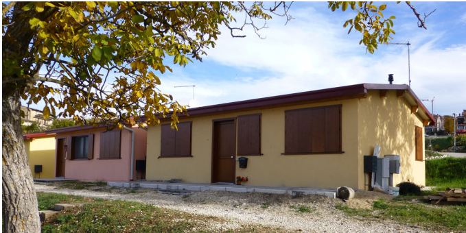
Fig. 9 Example of a MAP house in Fossa

maintenance problems (e.g. water infiltration) being observed at San Gregorio, where the quality of construction appears significantly worse than in Onna.