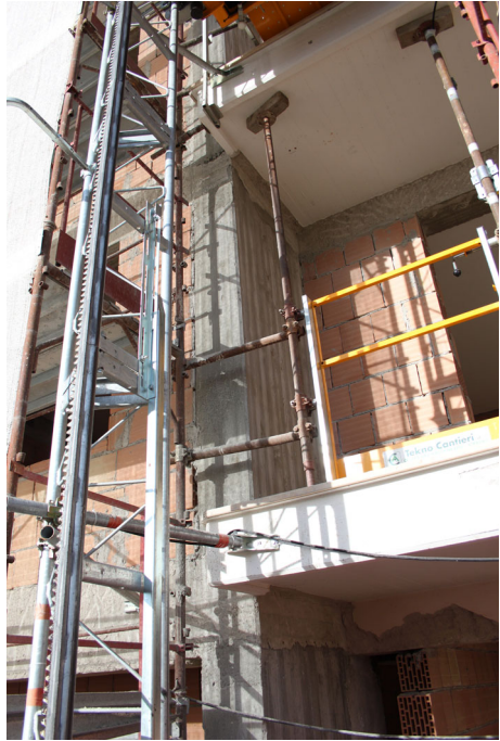
Fig. 10 Via Francia, Pettino. Photograph of extended perimeter column

buildings and multi-storey (up to eight storeys) residential and office buildings. The moment resisting frames are infilled with hollow clay bricks, stronger clay bricks or concrete blocks. Floor and roof systems for these structures are composed either of reinforced concrete slabs or are of beam and block construction, where small RC precast beams with steel reinforcement in the bottom, support hollow clay blocks over which wire mesh and concrete screed is placed (Rossetto et al. 2009).