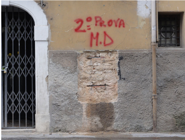
Fig. 6 Photo of typical double flat-jack test to determine compressive strength and mechanical characteristic of masonry

upgrade or improvement of the seismic behaviour at the global level of the aggregate, and less damaged buildings might need substantial intervention to reach homogeneity of behaviour with buildings that are more severely damaged and more heavily retrofitted ( Commissario per la Ricostruzione 2011 ).