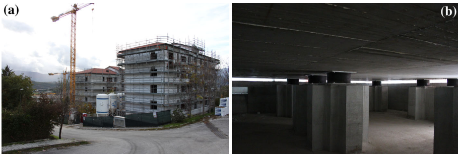
Fig. 13 Via Francia, Pettino. a Photo of the base-isolated buildings and b view of the base isolators in the basement

masonry, and dressed stone blocks. Walls in a few cases appear to be massive, but most commonly are formed by the so called “muratura a sacco”, namely two wythes of dressed stones poorly connected, sometimes with a rubble infill. Mortar is mainly lime mortar. Large squared stone blocks are used for quoins. A typical intervention that was observed to be extensively used at the few sites which were undergoing restoration at the time of the EEFIT mission and that could be visited is fluid mortar injection grouting of all bearing walls. The aim of such an intervention is to improve the coherence and cohesion of existing walls by injecting them with fluid grout through a series of drilled holes regularly spaced on a 500 mm grid and proceeding from the bottom to the top, after having sealed and repointed the mortar joint. Although for material compatibility only lime-based grouts should be used, often epoxy additives or cement are included in the mix for faster setting. While such additive might improve the short term strength and cohesion of the masonry, they can create serious long term problems in terms of decay of the original materials due to different hydro-thermal behaviour and salt content.