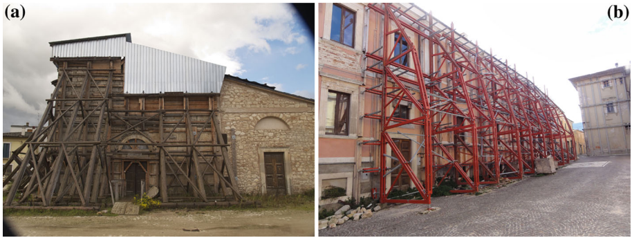
Fig. 1 Shoring system made of a wooden and b steel trusses used to prevent out of plane failure of masonry walls/panels