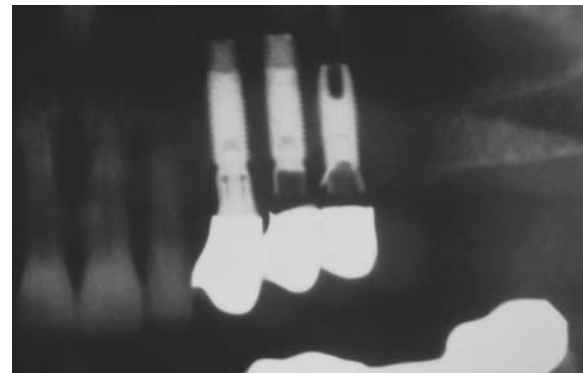
Fig. 3. Fixed prostheses supported over Core-Ven® implants (Case 1).