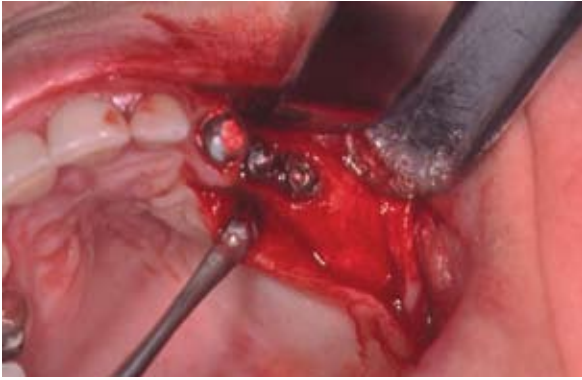
Fig. 5. Clinical view following bridge removal (Case 1).