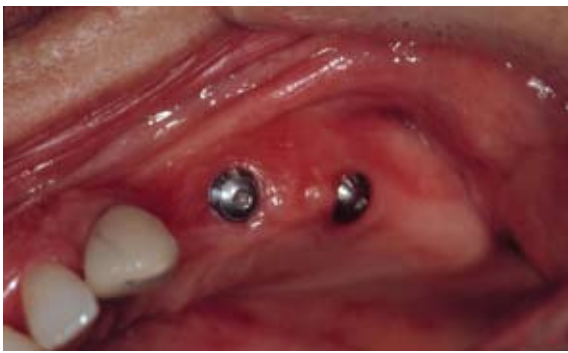
Fig. 7. Explanted implants. Note the bone bound to the implant surface (Case 1).