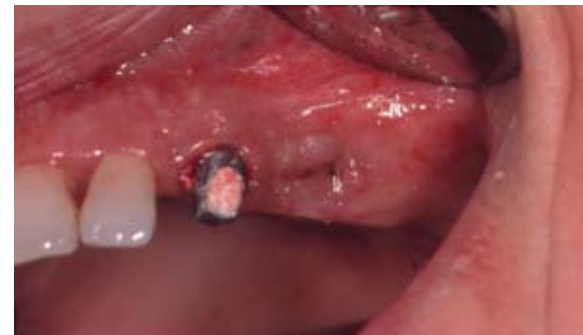
Fig. 4. Fracture of the two distal implants (Case 1).