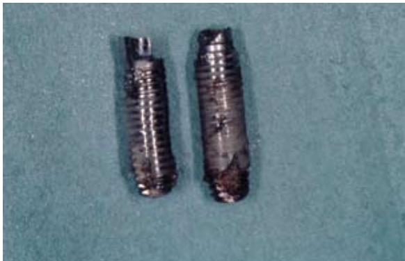
Fig. 6. Surgical view prior to trephine removal of the fractured implants (Case 1).