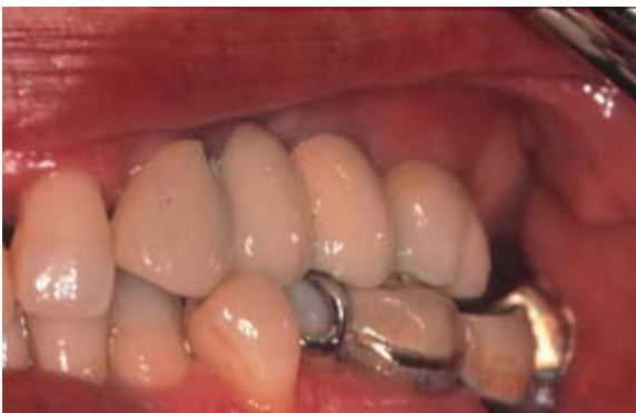
Fig. 8. Two Straumann AG® implants placed in the same surgical intervention (Case 1).

intervention (Figures 3-9). In the remaining 5 cases, regenerative techniques were used to prepare the bone bed for posterior implant placement.