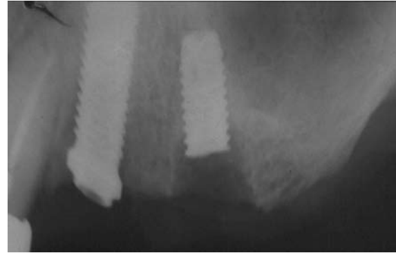
Fig. 1. Implant fracture (Case 12).

As to the management approach adopted, 17 fractured implants (81%) were removed entirely with the help of explantation trephines. In four of these cases no further implant placement proved necessary, while in 8 cases additional implants were placed in the same surgical