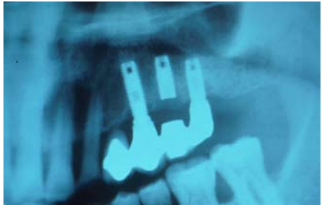
Fig. 10. Implant-supported fixed prosthesis. Apical portion of the fractured implant integrated in the maxillary bone.