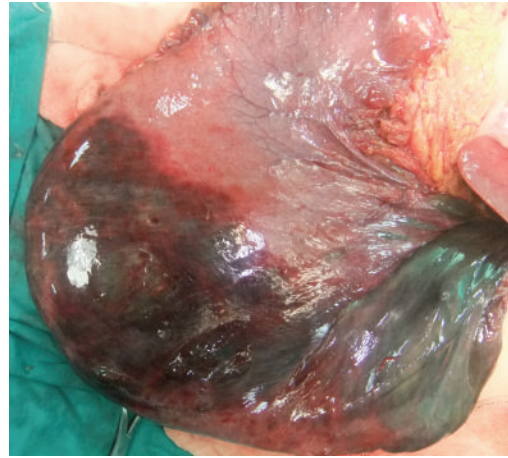
FIGURE 3: Diffuse necrotic zones in the gastric fundus and greater curvature of the corpus.

Acute gastric dilatation occurs mostly in women (67%) and is frequently found in the lesser curvature of the stomach [10]. AGD is also associated with a considerably high mortality rate (73%) [5]. In the present case, gastric necrosis due to AGD was detected in the greater curvature, fundus, and corpus of the stomach.