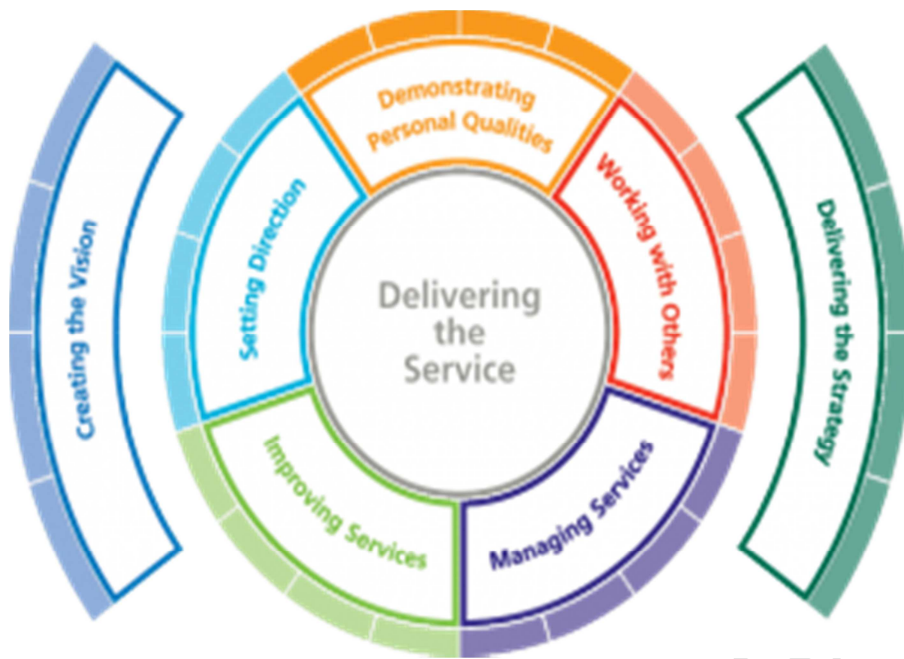
Figure 1: The NHS Leadership Framework