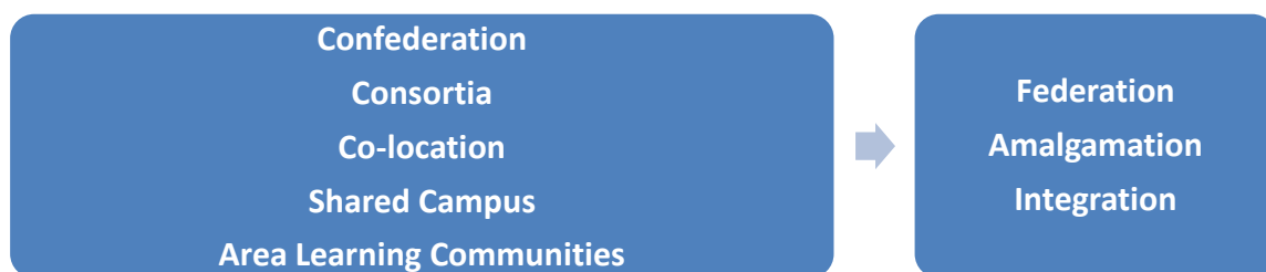
Figure 1: Collaboration Spectrum

The second strategy used to locate and assess the effectiveness of the Contested Space Partnership involves synthesising a series of criteria suggested by Atkinson et al. (2007) and Woods et al. (2006) in order to understand more about the depth and strength of a collaborative model. Woods et al. (2006: p59) outline seven points used to measure the extent of collaboration between institutions. These measurements include the degree to which collaborative partnerships have: strategic vision; group/area identity; organisational infrastructure; professional collaborative activity; penetration below senior management; innovated to seek significant transformation and normalised collaboration as part of the school's culture. These criteria are useful and can be applied to the activity proposed by the Contested Space Partnership. Arguably, partnerships that can evidence all or most of the criteria are likely to be described as deep collaborations (Head 2003). Atkinson et al (2007: p11) demonstrate that the notion of what constitutes collaboration is not entirely settled in the literature. They argue however, that three questions can be asked of collaborative models to determine their depth: