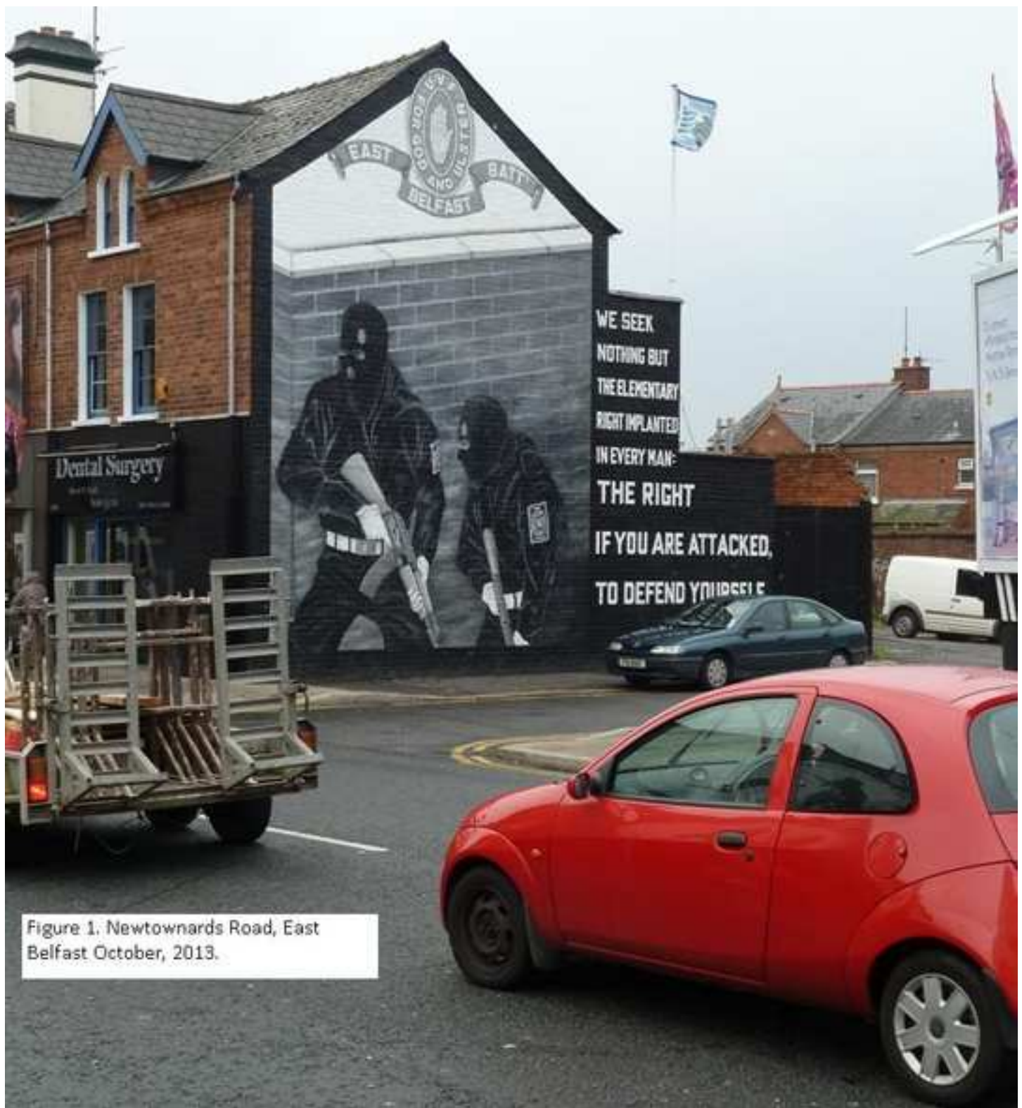
Figure 1. Newtownards Road, East Belfast October, 2013.