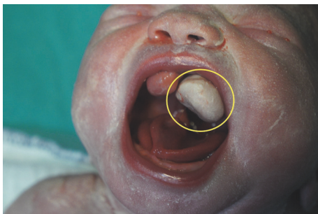
FIGURE 3: The epignathus, just after delivery, was shown in yellow circle.

solid mass. In the operation, following the excision of oral mass, incomplete cleft palate was surprisingly seen in the soft palate. In the histopathologic examination of the mass, the fat tissue was painted by S100 and surface epithelium with pancreatin [4]. Final histopathologic diagnosis was mature cystic teratoma. She underwent another surgery to excise accessory tongue and repair of incomplete soft palate cleft when she was 14 months old. Postoperative follow-up is normal after second operation.